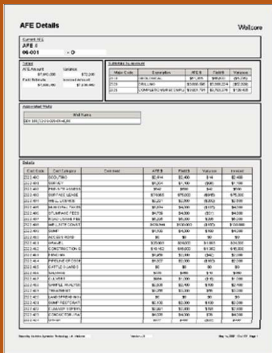
AFE Details Report

AFE details report displays all costs broken down by cost code and category..